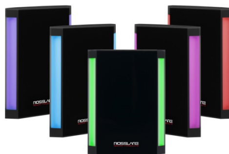
Figure 1: AY-R6255