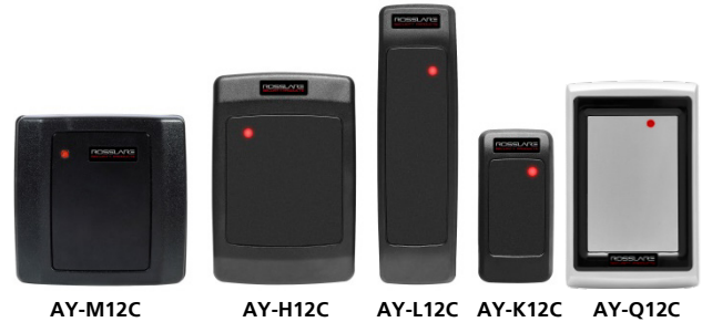
Figure 1: AY-x12C Series

The AY-x12C series reads the proximity card and transmits its data to the access control system, using Wiegand 26-Bit, Clock & Data, and serial RS-232 outputs.